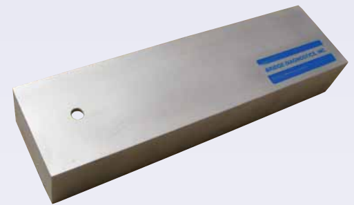
Rugged aluminum covers protect transducers for long-term monitoring