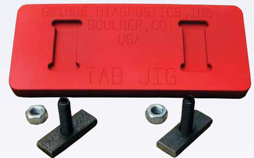
Mounting tabs and tab jig