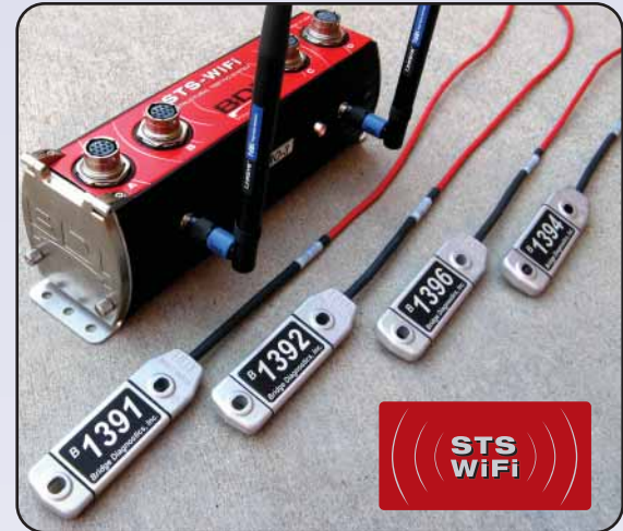
Strain transducers are supplied as standard equipment with BDI Structural Testing Systems