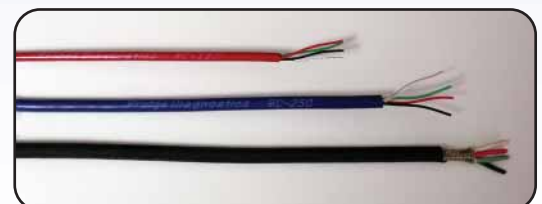
BDI Strain Transducer cable options